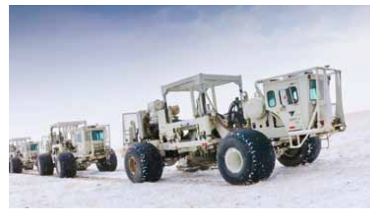
Seismic vibration trucks move together along the grid stopping at intervals to create soundwaves.

ect. The Kevin Dome Carbon Storage Project is a very large, eight-year carbon storage research effort. BSCSP, based at Montana State University in Bozeman, received funding in July 2011 from the U.S. Department of Energy to lead this cutting edge research. The overall goal is to demonstrate that carbon dioxide ( CO_2 ) can be stored safely and viably in regional geologic formations. The project involves permitting and injecting one million tonnes of CO_2 into deep porous rock formations, and monitoring the site at the surface and underground to gain a greater understanding of the economic and research complexities of long-term carbon storage.